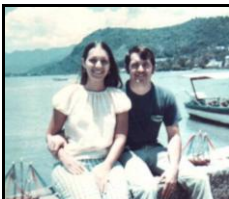
1976 We just arrived to Guadalajara to study Spanish. Our 1 st visit to Lake Chapala.