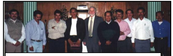
2009 Pastors of churches that are affiliated or are off-springs of the church in Zamora.