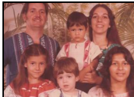
1984 Our God-given, wonderful family. So very blessed!