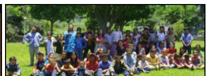
Children's ministry is essential & grows rapidly.