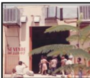
1984 The original building purchased was a one-story potato warehouse in Zamora's business district.