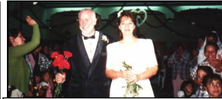
2000 We returned to Mexico to celebrate our 25 th wedding anniversary. To our surprise, the church planned a large ceremony to honor not only our marriage but us as founders.