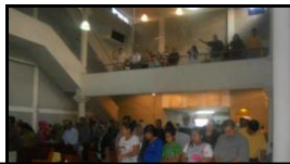
2013 The building continues now to a 3 rd story with balcony for overflow & fellowship area & offices. Since property is limited, building upwards is preferred.