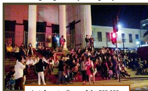
Antofagasta: Some of the 900,000 Chileans fleeing coastal areas at night on foot & wheelchairs. Tsunami alarms rang out all night.

Thank you for your financial gifts, for your love & concern & for your prayers. The Lord has been so very good to us as we take each day at a time, for that is all we are promised in this life: today & right now! As we see the world changing, always remember: our God does not change!