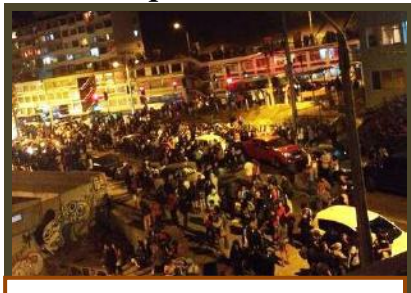
Antofagasta, 350 miles from the 8.2 earthquake, April 1, 2014: Heeding the tsunami alarm to evacuate to higher ground for hours during the night both April 1st & near midnight April 2nd.

The coastal city of Antofagasta is approximately 350 miles south of Iquique, the epicenter of the recent 8.2 earthquake (April 1st) & tremors. Sid arrived in Antofa two days earlier when the massive quake hit, shaking everything. Immediately, tsunami sirens alerted people in the flood zone to evacuate, and continued blaring all night. Though the church is only 4 blocks away from the ocean, it was considered a safe zone unless the quake would be much larger. The smaller quakes were seldom felt in Antofa but once again in the middle of the night, the tsunami alert siren would blare for people to run up the hill for safety. Over 900,000 Chileans along the coast have evacuated & nerves are raw. Much speculation concerning another massive quake(8.5-9.5)with monster multiple tsunamis(33+ft) has been predicted for this area similar to the 1877 quake with 8 tsunami waves of 33 ft. But we thank the Lord for His mercies that such a mammoth quake has not occurred as of yet. Please remember these people in your prayers.