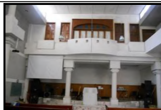
2015...Altar & children's ministry