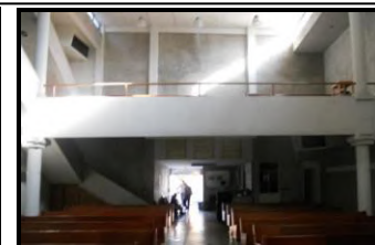
2015...Overflow balcony & front door

Thank you for your prayers and gifts that have enabled us to help others. As we continue investing in lives and ministries in both Mexico and Chile, we thank you for being such an important part of this outreach! Next month we will be sharing about the new church being built in Jacona in front of the university. We love you and thank our Lord for friends like you!