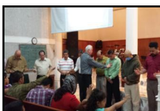
Ministering to leaders