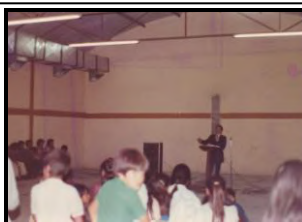
1983...First meetings held

1979-2015....Growing up in the city of Zamora, Michoacán Mexico. From a potato warehouse on a cramped downtown street to a 3-story building.