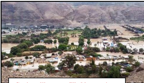
Copiapo like a cup filled by ragging, muddy waters. Mountain view.