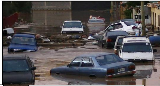
Cars bobbing in the flood waters of the Chilean "Aluvion"