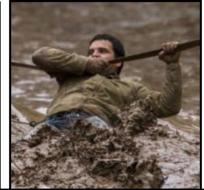
Holding on for dear life in the rapidly moving muddy waters