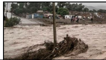
Mar 26 - Copiapo River becomes a raging monster, overflowing its bank with water, mud & rocks, washing away lives, buildings, & vehicles.