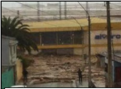
Mudslide flood rushing downhill thru the cities and towns of the 3rd Region.