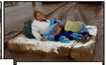
An elderly finds refuge on her mattress in the street