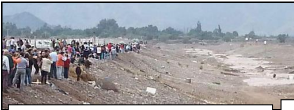
Mar 24- People in Copiapo waiting with anticipation to see the river with water after 17 yrs of it being dry, not realizing it would be in their houses too!

Much speculation has been made on the amount of lives lost, since many are missing. But the destruction is unimaginable. the country highway system is severed preventing vehicles from traveling through the 3rd Region of Atacama to the 1st & 2nd Regions. This brutal reality has people with no drinking water, nor food nor homes.