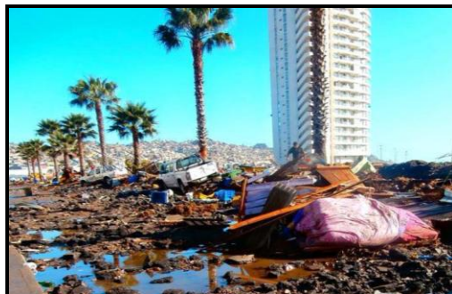
La Serena - Ave del Mar after the tsunami