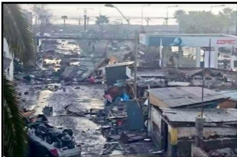
Coquimbo - The aftermath of the tsunamis