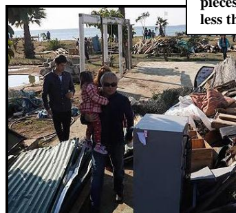
Wading through devastation