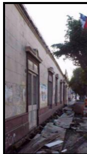
Ovalle - roof fell near where we live