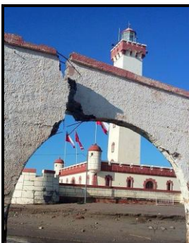
Serena - El Faro/Lighthouse