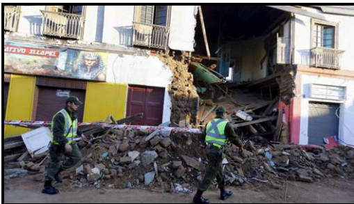
Illapel - near epicenter

Chile is residual. She knows this is part of her history & her future. As of now, less than 15 have lost their lives. Most damage has occurred due to tsunamis. When structural damage occurs, investigation is made to see if the construction was built according to their strict codes.