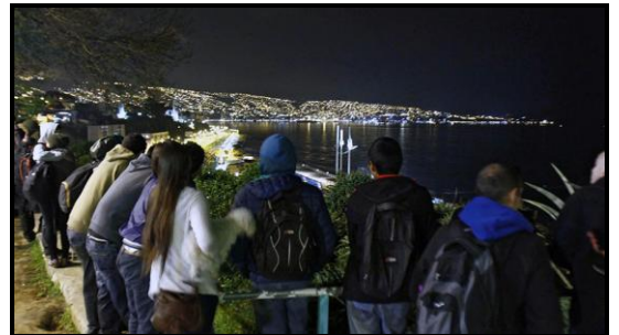
Valparaiso - tsunami alert to evacuate low-lying coastal areas, the way of life in Chile