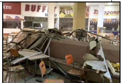
La Serena Mall - P. Guillermo & family were sitting here eating when the 8.3 earthquake struck. Ceiling pieces fell & glass exploded everywhere. Located less than a mile from the ocean.