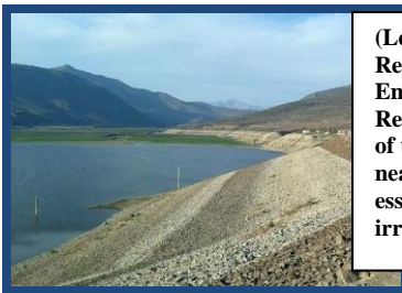
(Left) Refilling Embalse Recoleta, one of the lakes nearly dry but essential for irrigation

THE DROUGHT HAS FINALLY BROKEN!!!! HALLELUJAH!!!! Thank you Jesus for the current: El Niño of 2015! Even up until the middle of March of this year, the prognosis looked bleak. But at the end of March, the rains finally began & rains like haven't been seen in 80 years!!!!!! In Antofagasta, which is in one of the driest places in the world, they receive 18 years of rain in 12 hours!!!! Dramatic flooding occurred, lives lost, homes swept away, towns completely inundated with not just water but mud and rock from landslides. But the people are extremely thankful for the blessed rain fall. Thank you for praying with us for rain. Please pray with us for those who must restart their lives.