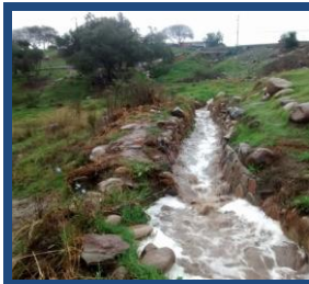
Irrigation canals from lakes have come alive once more. Farmer must purchase r rights in last few years, no water till now!