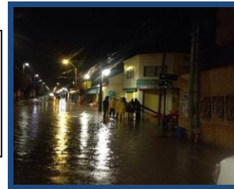
(Left) Even in the rain, people were happy to once again have life being poured back into their lands.