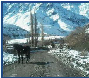
Chile is in South America, south of the Equator, meaning June-August are winter months & are very cold. Rain usually comes also in the winter and falls as snow in the San Andres Mountains. In the summer the snow melts and fills the reservoirs .